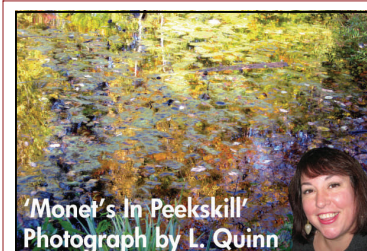
'Monet's In Peekskill'

The Peekskill Industrial Development Agency assisted in the company's expansion by using its powers to provide the company with a variety of economic development incentives which will make the company's consolidation and expansion more cost effective.